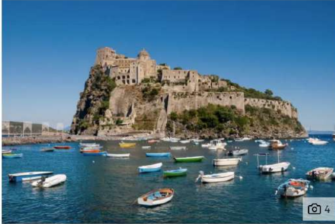
Aragonese Castle in Ischia, Italy