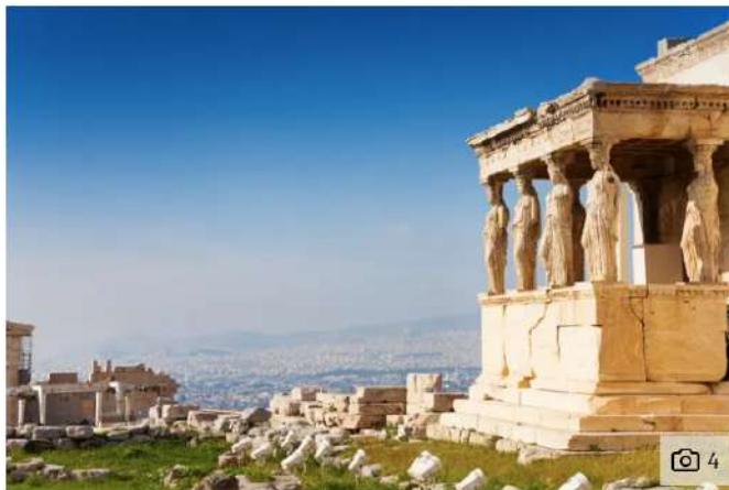
Athens without the crowds

"I can't wait for Canada. And in particular, the untrammelled wilderness and waterways of western Canada, where I'm off to in October. Since restrictions on international travellers eased last month, I've been frantically planning a mammoth trip to Vancouver Island and the Yukon, which will see me heading into one of the most remote parts of North America: the Peel River watershed. After the past 18 months, we all deserve that kind of restorative peace and stillness." Mike MacEacheran