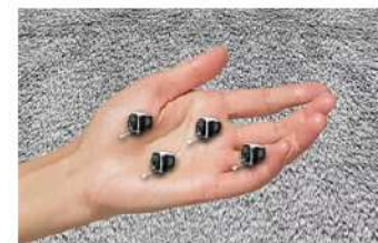
Espartinas: Lee esto antes de hacerte una prueba de audición