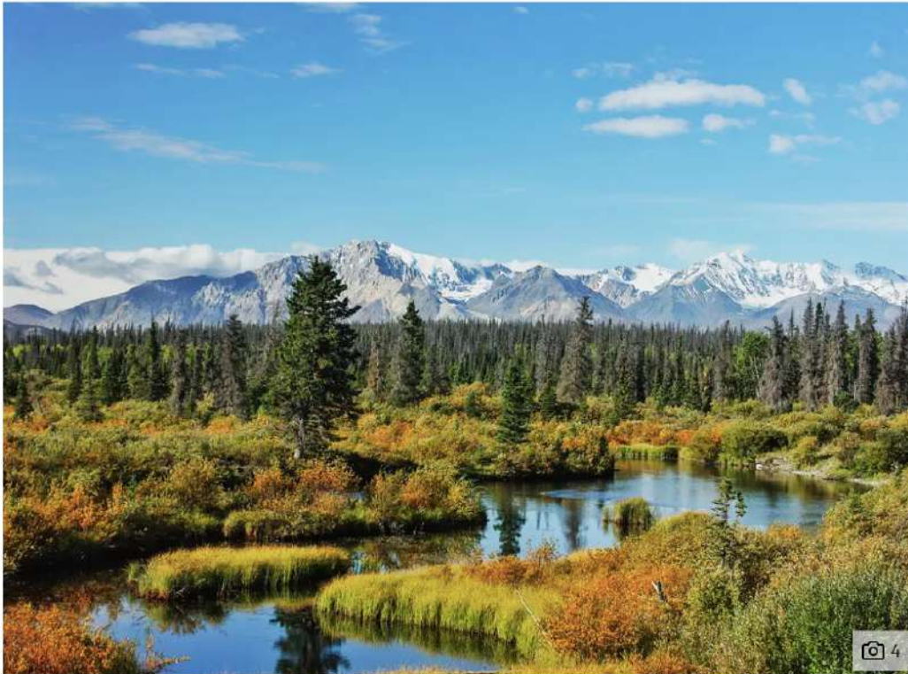
Canada's Yukon territory is sparsely populated and home to many indigenous communities