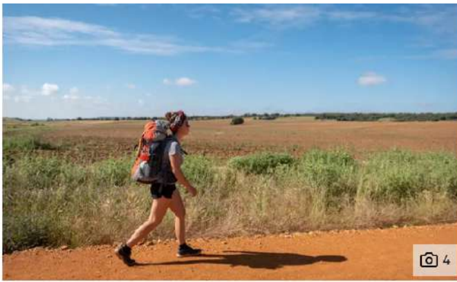
Pilgrim walking the Camino de Santiago near Astorga, Spain